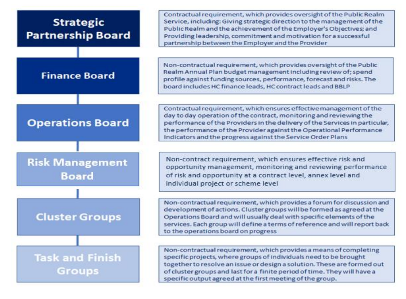
Figure 1: Formal Governance Structures

The formal governance mechanisms of the contract are set out in Figure 1.